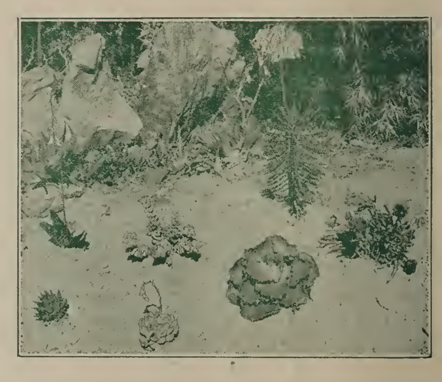
Upper row, left to right: Gasteria (typical), Crassula monticola, Kalanchoe tubaflora; lower row: Haworthia margaretifera var. granata, Echeveria elegans, Echevaria crenulata, Cephalophyllum alstoni.